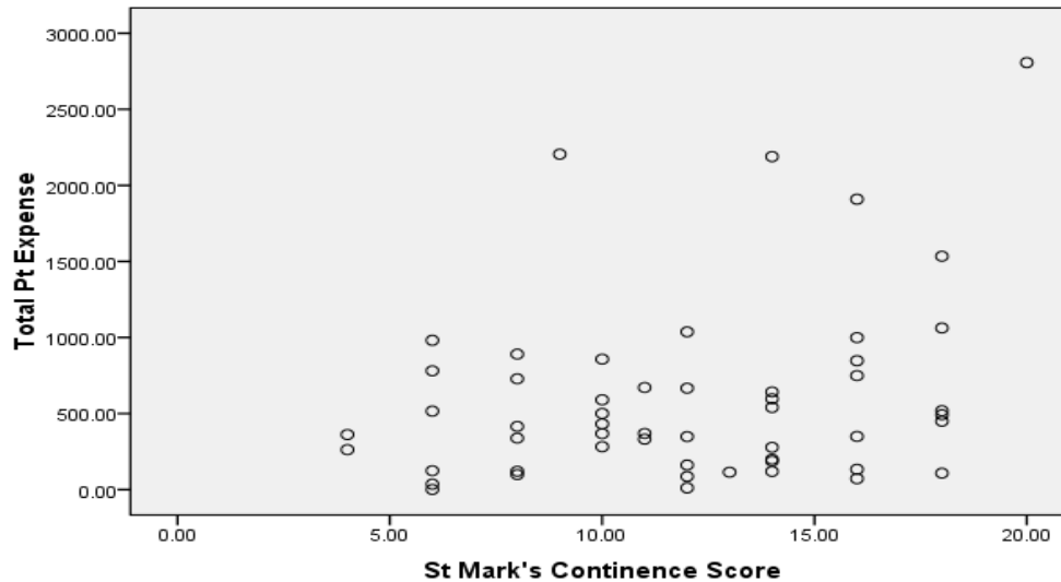
Figure 2. Total personal costs vs incontinence severity St Mark's score

The Spearman rank correlation showed no significant relation between total personal costs and severity ( r=0.21 ). When we drilled down into the costs just for pads and creams alone, a relationship became apparent ( r= 0.34 , p=0.5 ).