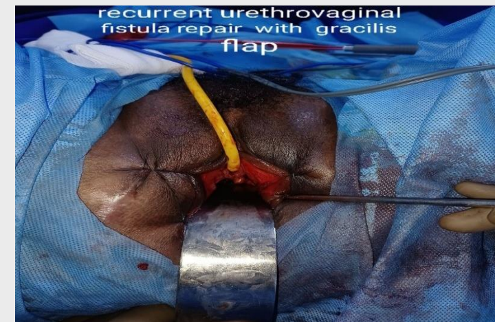
FIGURE 3: POST OP: Suprapubic catheter was removed after six weeks and Urethral Catheter was removed after eight weeks post op.