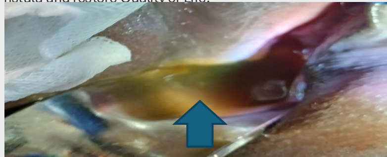
FIGURE 1: PRE OP: Pooling of Urine in Vagina