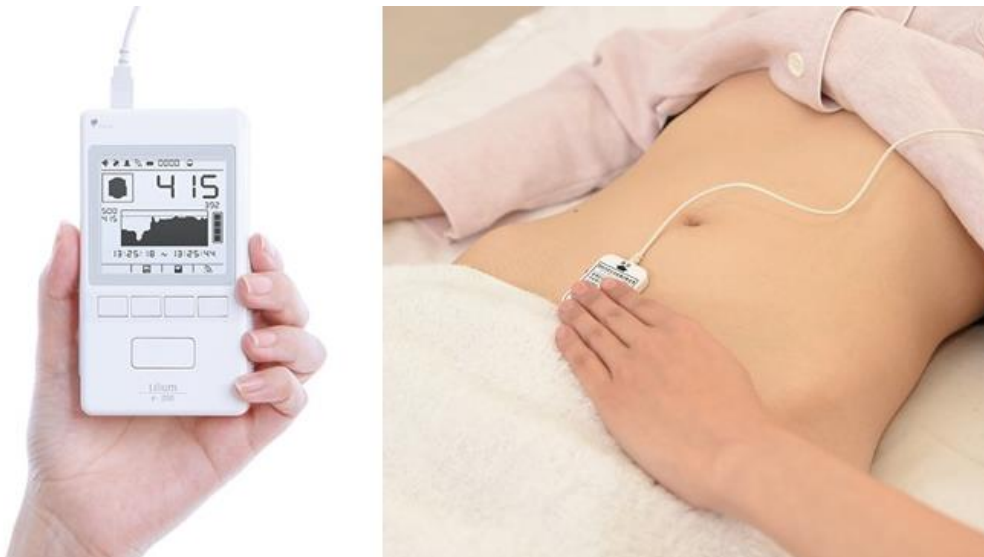
Figure 1. A new portable handheld bladder scanner, Liliium® \alpha -200.

A new portable handheld bladder scanner, Liliium® \alpha -200, is applicable with good accuracy.