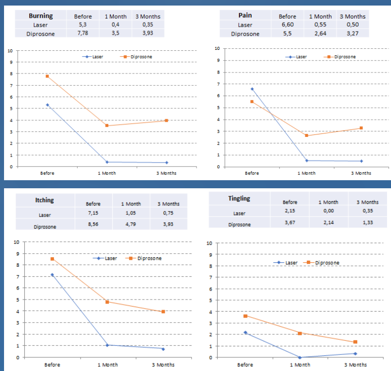
Fig.1 Severity of Lichen Symptoms: Burning, Pain, Itching, Tingling (VAS 0-10)

40 patients were randomized into study group (laser, A) and control group (topical steroid, B) with 20 patients each. All patients from laser and 18 patients from control group were completed the treatments and were followed up so far for the first 3 months. Severity of lichen symptoms reduced significantly in both group, but more in laser group: burning went from 5.5 to 0.3 at 3M FU in group A and from 7.7 to 3.9 in B group; pain reduced from 6.6 to 0.5 in A group and from 5.5 to 3.3 in B group; itching: group A – 7.1 to 0.7, group B – 8.6 to 5.5 and tingling: group A – 2.1 to 0.3, group B – 3.7 to 1.3. Sexual function significantly improved in laser group (only 10% of patients complained of dyspareunia at 3M FU in comparison of 55% at baseline and 15% of anorgasmia vs.40% at baseline) but not also in group B (dyspareunia: 67% at 3M FU and 44% before; anorgasmia: 40% at 3M FU and 39% before). Biopsies showed the presence of the LC in 100% of patients in group A and 89% in group B at the baseline and in 50% in group A and 60% in group B at 3M FU. All patients from laser group were very satisfied with results at 3M FU, while the group B had 13% very satisfied and 33% satisfied patients; 27% were somehow satisfied and 27% not satisfied. Laser treatment discomfort was very low (at Tx1: 0.65, at Tx2: 0.2 and at Tx3: 0.0) and all adverse effects were mild and transient.