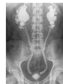
Figure 1 (a) Urodynamic trace of small capacity bladder with detrusor overactivity (b) CTU showing small capacity bladder with bilateral reflux